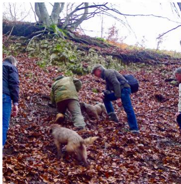
Teambuiding with Luigi (It)