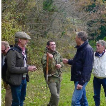
Inspiring, educational and FUN