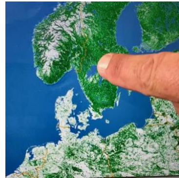
in endless woodlands