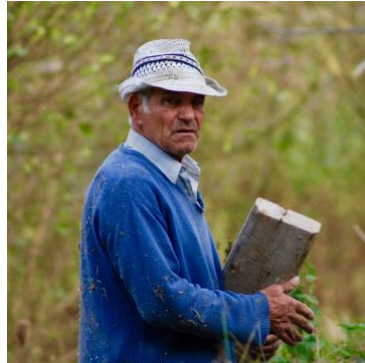
with memorable encounters