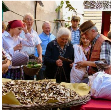
Porcini festival in Borgorato (It)