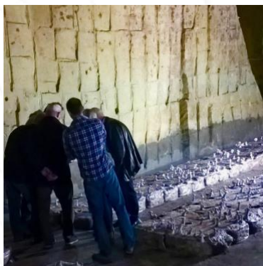
With chefs in the Blue foot caves