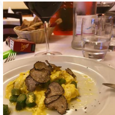
the grateful result . . . . and tasting wine is daily business !